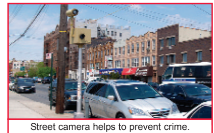
Street camera helps to prevent crime.