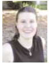
By Kathryn Shane

With a land area slightly smaller than that of the state of Maryland, the Solomon Islands, located off the northeast coast of Australia, aren't often on the radar screen of international ministries.