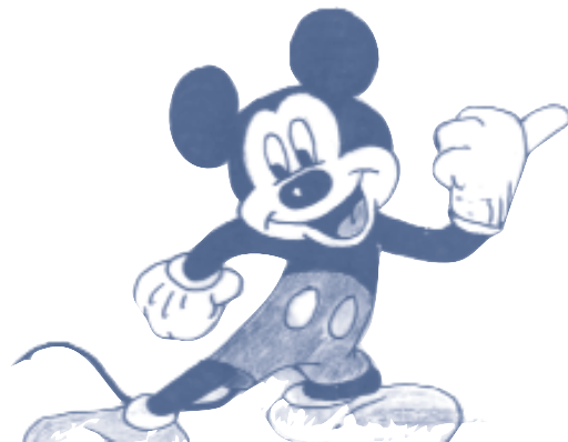
Elden L., CBI Student, NM

The verdict rendered, justice is done. In a heavenly court, your battles are won!