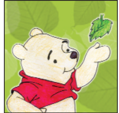
Chevelle L., CBI Student, MI