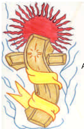
Angel O., CBI Student, CT