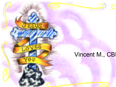
Vincent M., CBI Student, GA

What joy is mine as I dance to and fro, but Lord, hold me tightly, don't let me go. If I'm lost from Your presence I'll flounder and fall, who knows where I'll land, if I land at all? But You are faithful, Your promise is true, the old me is gone; this creature is new. But You hold the string, You are in control, so I keep going higher, reaching out for the goal. When at last You must wind me down, may I land safe in Your loving arms.